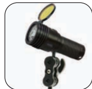
*Photographic Arms and Clips are sold separately