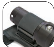
Tighten by pulling the Velcro