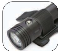
Put the Velcro through the slot of the plate and through the loop