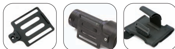
Aluminum Adapter plate