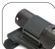
Tighten by pulling the Velcro