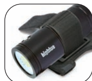
Put the Velcro through the slot of the plate and through the loop