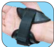
Tighten by pulling the velco