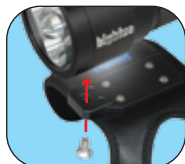
Fix the glove on the light with the supplied screw