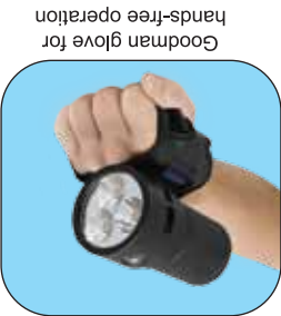
Goodman glove for hands-free operation