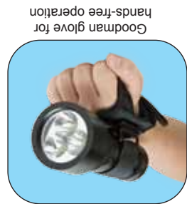
Goodman glove for hands-free operation