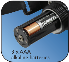
3 x AAA alkaline batteries

Unscrew the body and then slide out the old battery pack.