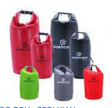
SACO DRY - SBBLXIAN

Waterproof bag in 10 - 20 and 40 litre. 20 and 40 liter included shoulder strap. RRP from 10,00