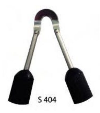
Wishbone - S404 RRP21,00