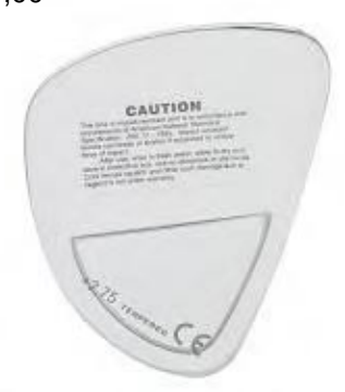
Plus Lens for Optical mask – GLC0

Stretch strap with non-slip. Included snorkel holder. Adjustable. Ultimate comfort. RRP 17,00