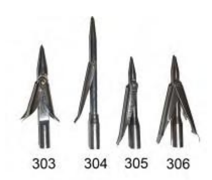
SPEAR HEAD - 9830 6 mm. Thread.