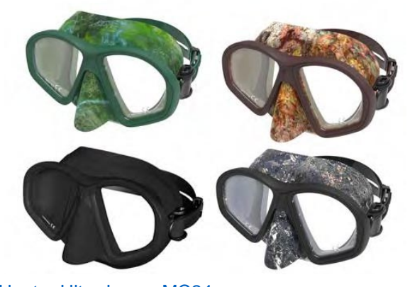
<u>Hunter Ultra-Low – MC24</u> Apnea and U/V-hunter mask. Ultra low volumen. RRP from 41,00

Ultra extreme low volume. Frameless double lenses. Clear lens. Alternativ Smoke mirror lens: Glare reduction at the surface of water. Mirror lens not only provides a new and refreshing look at standard tempered glass lenses, but also enhances the functionality of the lenses themselves. Included mask box. RRP from 68,00