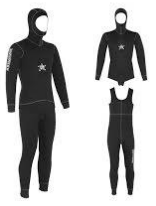
PACIFIC 5 mm. S/C - 6300

Two-piece wet suit in 5 mm. Sheico neoprene. Preformed design for best fit. Black nylon outside and Plush inside for more warmth. Jacket with chest pad reinforcement. Long John with Supratek reinforcement on knees and upper part smooth skin inside gives more warmth. Smooth skin seals around face, ankles and wrists. RRP 159,00