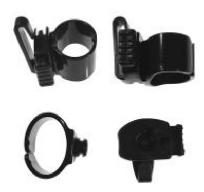
Snorkel keeper - AAAA-QBA-0146BK RRP 4,00

Easily replaceable frame for Accent mask. RRP from 4,00