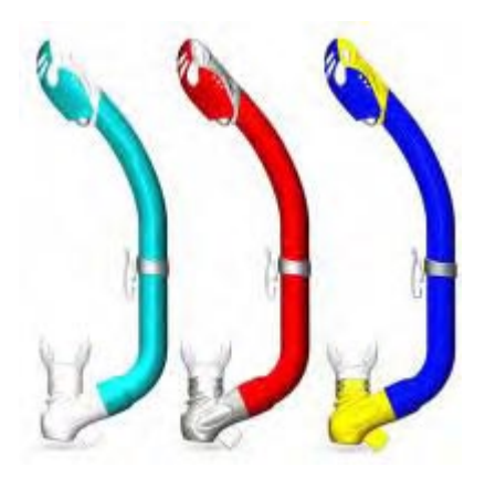
Junior Dry - SB08S

Junior Dry snorkel with top and bottom valve. Silicone mouthpiece. Whistle in mouthpiece for safety. RRP 23,00