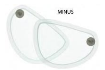
Minus Lens for Optical mask – GLD0

Optical MINUS lens for SeaPro Optical mask. RRP 30,00