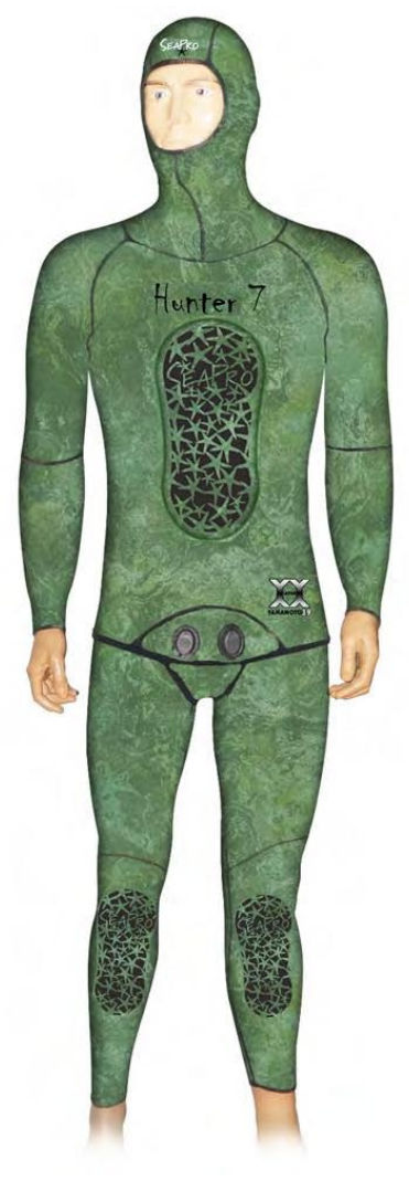
Hunter 7 - YM391043M7 NEW The fabrics camouflage pattern specially designed for SeaPro in close co-operation with market leaders within spear fishing to be used in Scandinavian waters. The green color has specifically been chosen to match the camouflage color of the Danish special forces. Yamamoto 39 Neoprene stands out with its high thermal insulation, resistance to crushing, characteristic comfort and environmentally friendly structure. The neoprene is of the most environmentally friendly type. The outer surface is Micro Polyester jersey, the inner surface is Open cell. The outside Jersey fabric is elastanereinforced to make it the most flexible and durable. Cushion reinforcement in the chest area that makes it easy to load harpoons. Knee and elbow protection specially designed for SeaPro. Safe and durable buckle fastening system. Ergonomic cut. 7 mm and sizes from S till XXXXL. RRP from 300.00