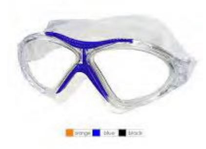
Ventosa Sr. - 50073

Transparent silicone senior googles. Colored frame. Polycarbonate lenses. RRP 24,00