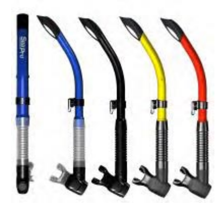
Comfort semi-dry - SC86

Semi-dry snorkel for adult. Silicone mouth pice with dump valve. Flex tube part for maximum comfort.