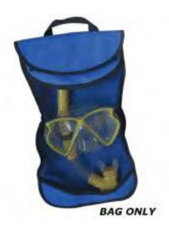
Snorkling bag - KY231-BL-QBA Snorkling bag with mesh front. Blue with balck mesh. 41x21,5 cm. RRP 14.00