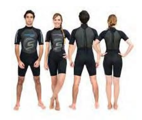
FIJI 3 MM - SBTR1HN

The Fiji is a 3mm neoprene with Thermo Dynamic panels located at the chest and back, areas with the most need for protection from the elements. The Fiji is fast drying due to it's waterproof material. This shorty is idea for scuba diving and snorkeling in tropical waters as well as for practicing water sports. The Fiji offers protection from chafing and sunburn as well as helping to conserve body heat, all while still allowing for complete freedom of movement in the water. RRP from 89,00