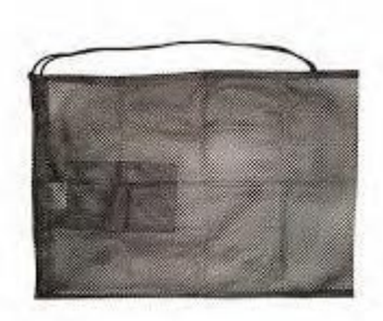
Mesh bag - MB3-K Ideal for carrying masks, snorkels, and finns. Shoulder strap and fold-in pouch included. Measurement: 64 cm length x 44 cm width. RRP 13,00