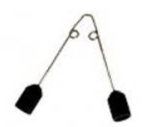
Wishbone . 98403 RRP 8,00