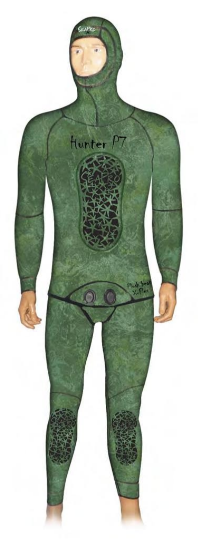
Hunter P7 - JABLKHU7 NEW The fabrics camouflage pattern specially designed for SeaPro in close co-operation with market leaders within spear fishing to be used in Scandinavian waters. The green color has specifically been chosen to match the camouflage color of the Danish special forces. The outside Jersev fabric is elastane-reinforced to make it the most flexible and durable. The inner surface is grey Super Plush for maximum comfort and warmth. Cushion reinforcement specially designed for SeaPro in the chest area makes it easy to load harpoons. Knee and elbow protection in extra strong and durable material to make the suit last longer. Safe and strong buckle fastening system. Smooth seals at ankle, wrist, face and top of pants prevents water from entering the suits and keeps you warm. Ergonomic cut. 7 mm and sizes from S till XXXXL... RRP from 291,00