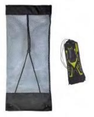
Snorkling bag Sr. - KY066-QBA Snorkling bag in mesh. Holds complete set of mask, fins, and snorkel. Closing straps can be used as shoulder straps. Black mesh. 28x65 cm. RRP 9,00