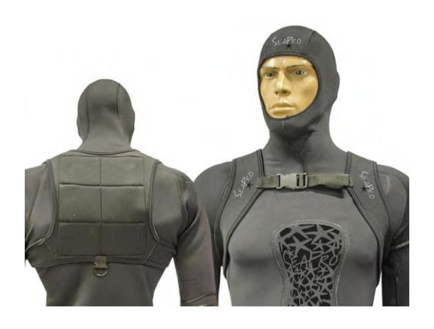
Black Weight Vest - SAYLMB NEW NOTE - will also be available in SeaPro Hunter Camo green.

Hunter Weight Vest helps to reduce the weight on the waist in free diving. It will make a more comfortable dive by spreading the weight to the upper part of the body, and to make the upper part of the body parallel to the surface when at the surface. It is made of 45mm environmentally friendly Neoprene fabric. 6 weight compartments. Sold excluding lead weights. Designed for safety to be easily removed in case of emergency. Model 1 for a person 60-80 kilo. Model 2 for 80-100 kilo. Model 3 for 100-120 kilo. RRP from 46,00