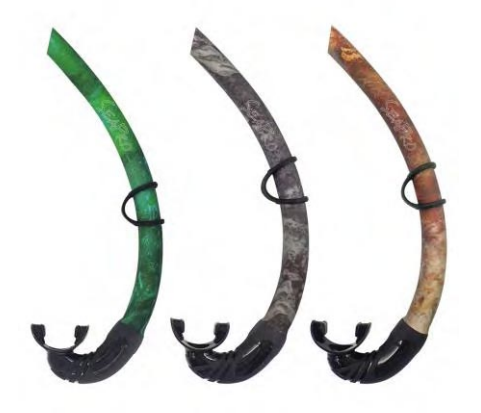
Hunter Camo snorkel - SE29KT NEW Spear fishing camo snorkel. Solid and durable snorkel keeper. Silicone mouthpiece. RRP 18,00

Semi-dry snorkel for adult. Silicone mouthpiece with dump valve. Splash top. RRP 18,00