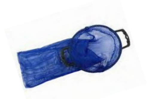
Fishing net for shells - 12100 Collecting bag for fish and shells. RRP 17,00