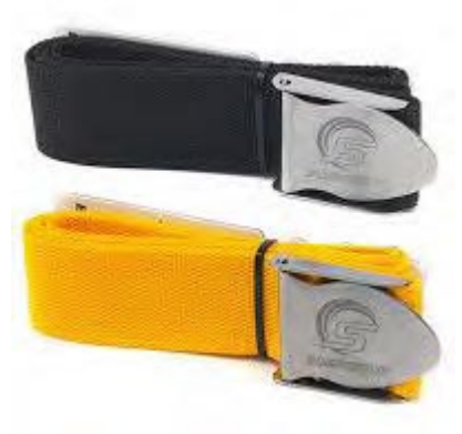
BELT INOX - SBZI01

Hunter Weight Vest helps to reduce the weight on the waist in free diving. It will make a more comfortable dive by spreading the weight to the upper part of the body, and to make the upper part of the body parallel to the surface when at the surface. It is made of 45mm environmentally friendly Neoprene fabric. 6 weight compartments. Sold excluding lead weights. Designed for safety to be easily removed in case of emergency. Model 1 for a person 60-80 kilo. Model 2 for 80-100 kilo. Model 3 for 100-120 kilo. RRP from 46,00