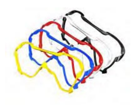
Accent frame - PM860-P

Optical MINUS lens for SeaPro Optical mask. RRP 30,00