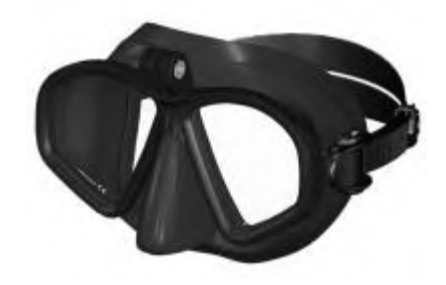
Go mask - ME120022 All black 2 lenses low volumen mask. Included Go-Pro attachment. Included mask box. RRP 55,00